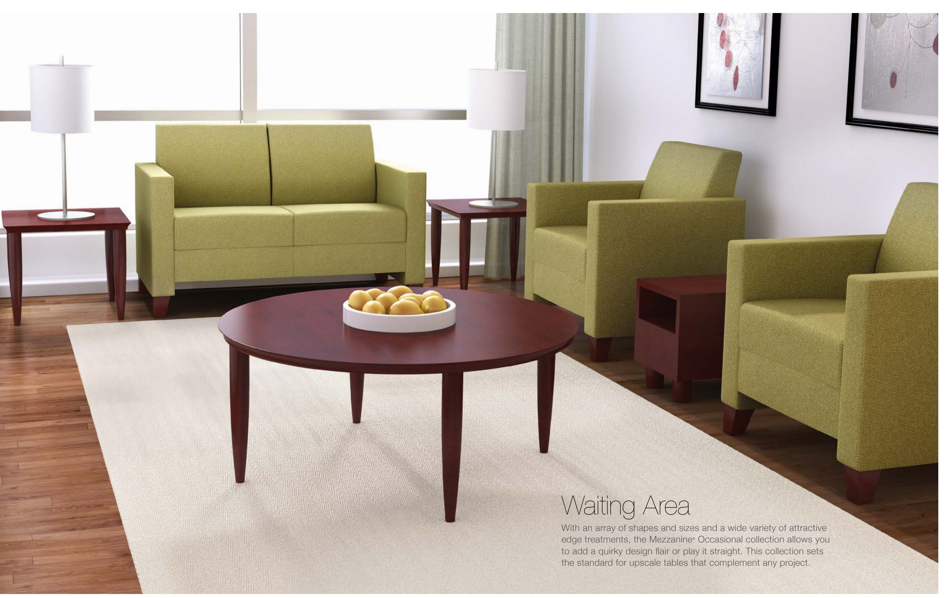
Composium Sharp settee and clubs, square back, 3/4 valance, wood tapered square feet in amber mahogany finish. TEXTILE: SitOnIt – Spice, Fennel. Mezzanine Occasional oval table in amber mahogany finish. Mezzanine Cube end table in amber mahogany finish. Mezzanine Occasional square tables in amber mahogany finish.