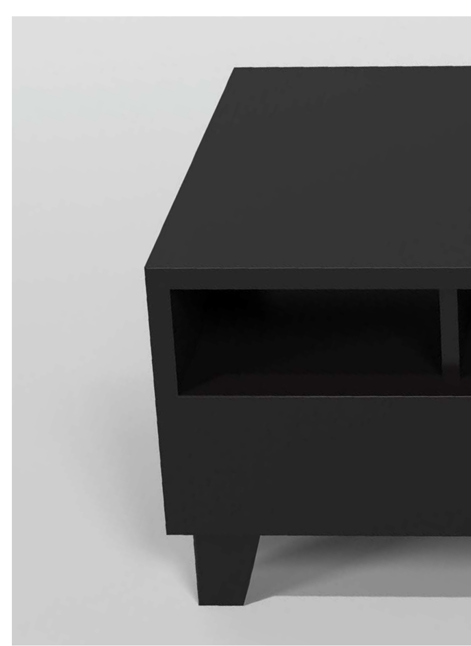
Mezzanine Cube coffee table in espresso finish.