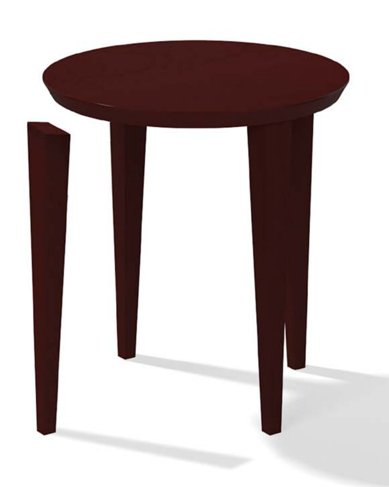
Table joints are fastened with tongue and groove and high-strength glue, providing inherent rigidity and durability while presenting a seamless, clean and finished style.

Mezzanine Cube tables are constructed from medium density fiberboard with maple veneer and a hard maple edge band using the highest quality veneers and hardwoods.