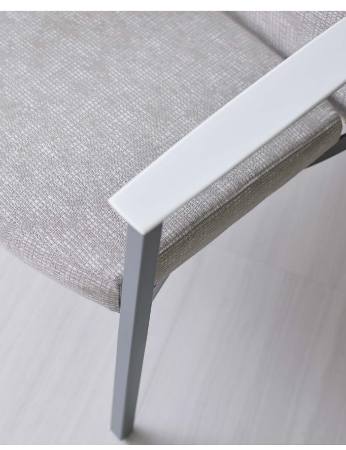
Solid surface arm caps shown in Modern White