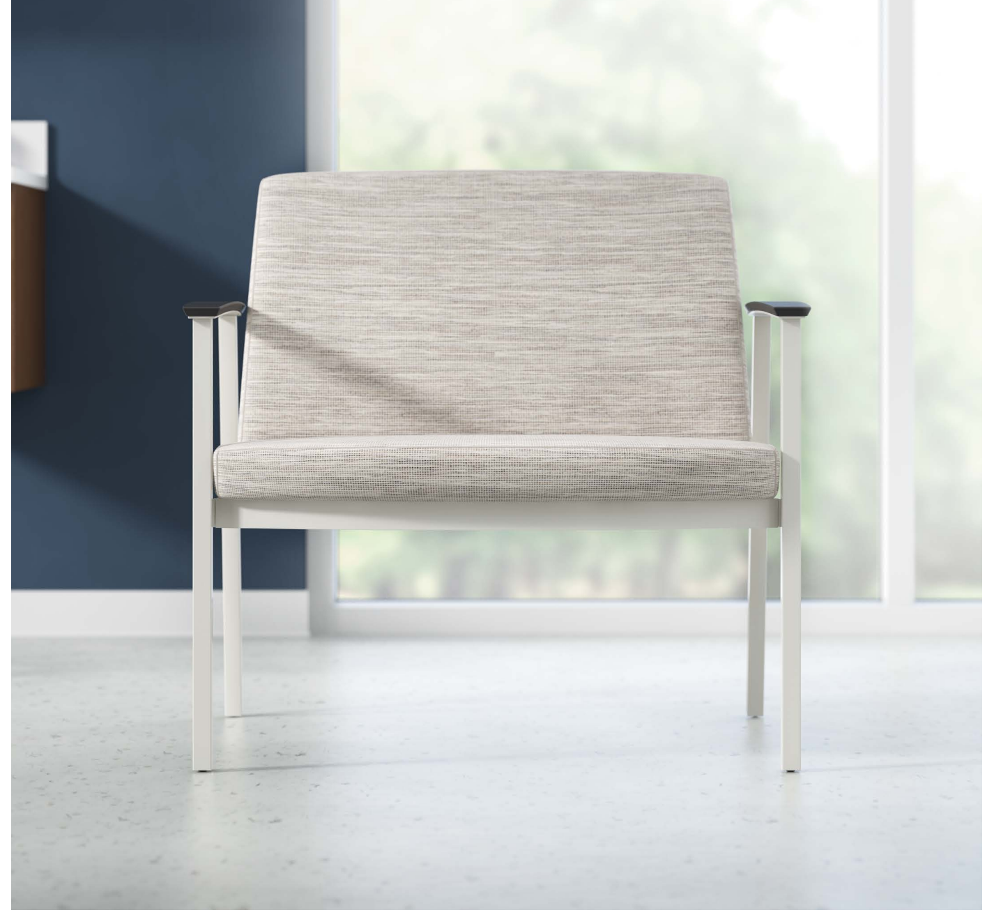
Serony bariatric seating