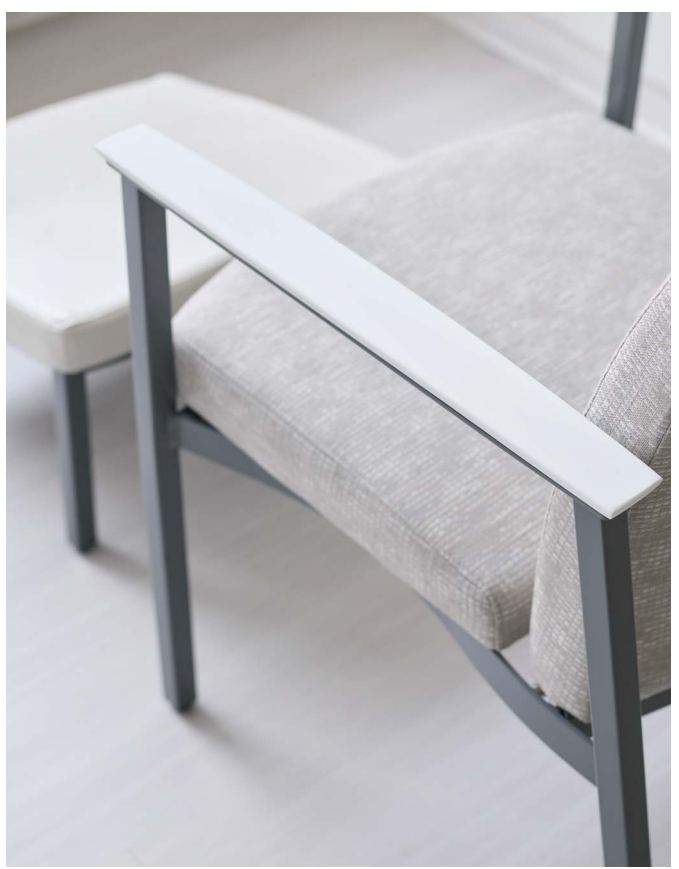
Metal frame shown in Graphite