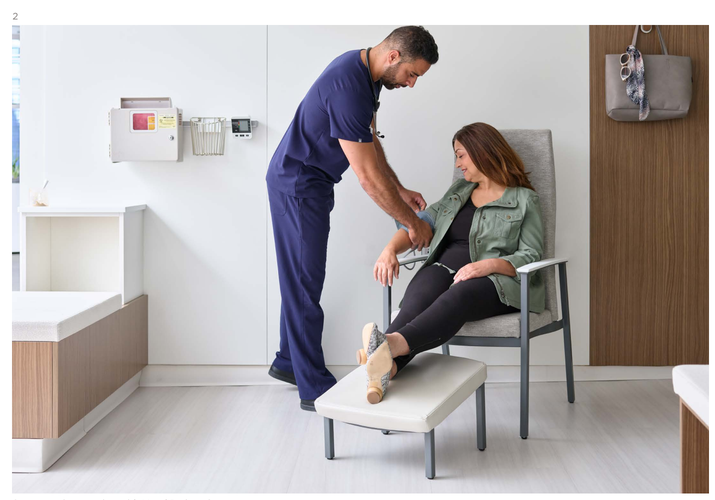
Serony patient seating with Metal Patient Ottoman